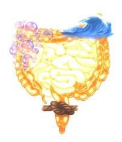
Typical intestinal symptoms

Candida is a much used general term. Usually it refers to Candida albicans. Yet there are many more species like Candida parapsilosis, or glabrata. Sometimes symptoms can also be caused by moulds like Aspergillus niger or Geotrichum (milkmould). It is essential therefore to know which of these many possibilities is the cause of the problem, and that is why an accurate analysis is needed before treatment should begin.