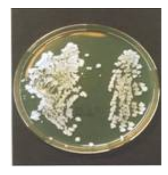
Candida culture bred from a toothbrush

This laboratory will not only identify the exact species of fungus but also investigate if it is a harmless or an invasive kind.